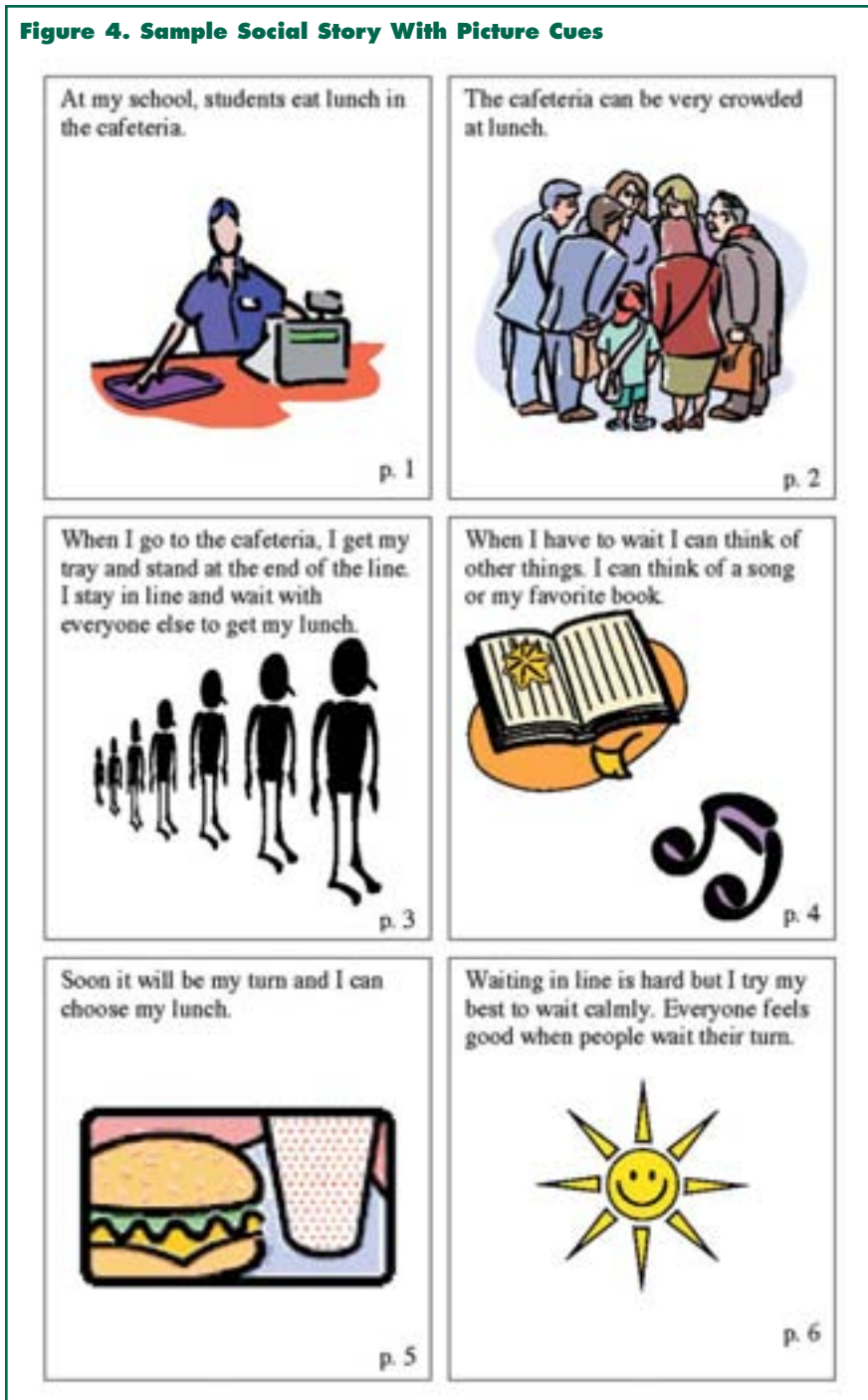
Figure 4. Sample Social Story With Picture Cues

eventually not be required at all. It is a good idea, however, to keep social stories for future reference in case a behavior reappears.